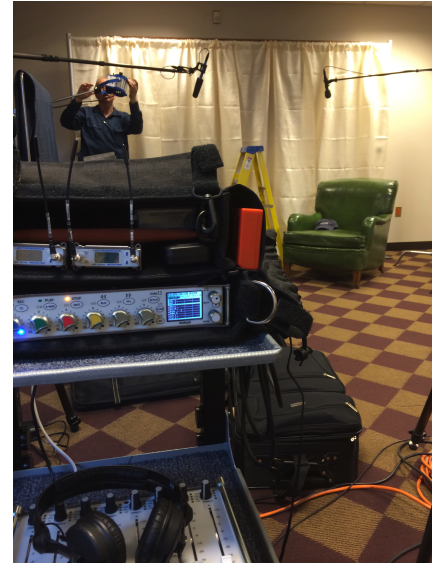
Setting up for Brad Wyatt interview